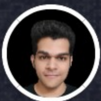
Shushant Lakhyani Building TechnoBizzVault